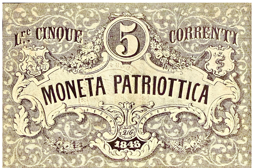
5 LIRE NOTE — 77 X 114 MM