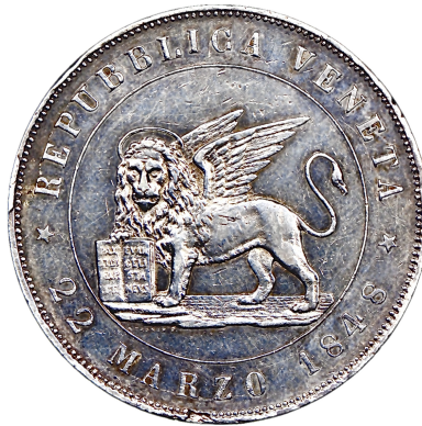
5 LIRE SILVER 37 MM DIAM.