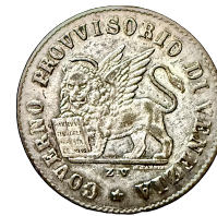
15 CENTESIMI BILLON 18 MM DIAM.