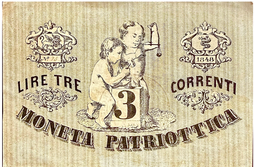
3 LIRE NOTE — 76 X 113 MM

The paper money was successful enough that silver and gold flowed into the Venetian treasury.