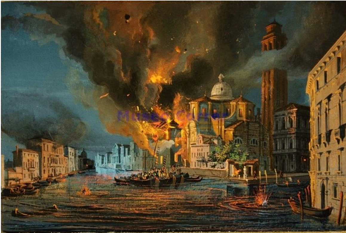
The Fire of the Scuola Di San Geremia in Venice Hit by the Austrian Bombardment of 1849

Painting by Luigi Querena (1824–1887) circa 1850