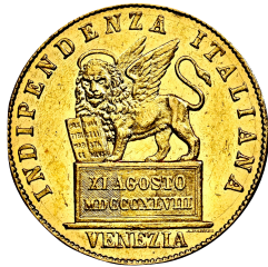
20 LIRE GOLD 23 MM DIAM.