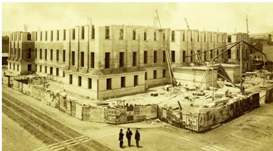
Eadweard Muybridge Photo of the Second Mint Under Construction