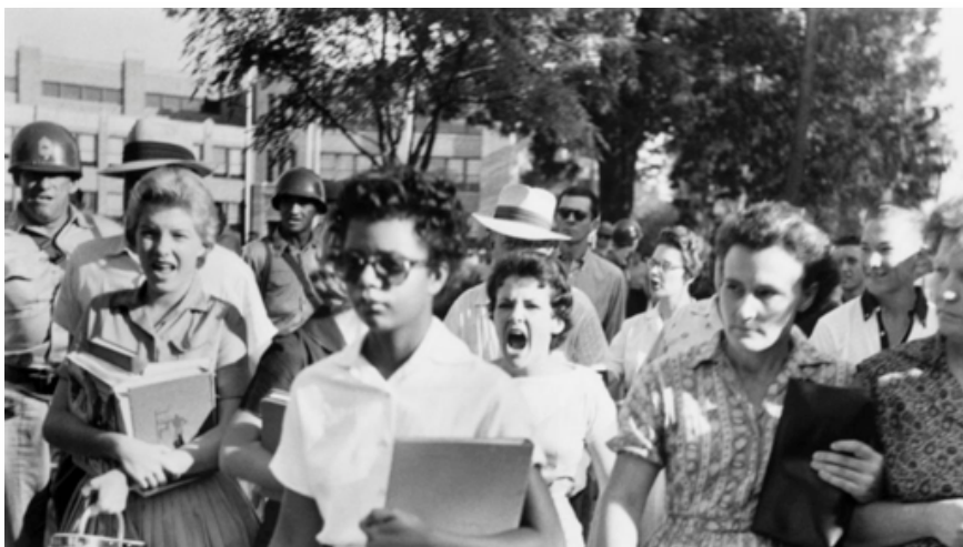
Elizabeth Eckford Surrounded by Angry White People, September 4, 1957