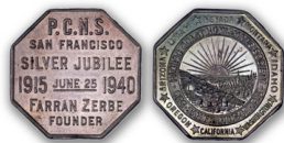
25th Anniversary, 1940