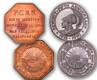
800th Meeting, 1982 75th Anniversary, 1990