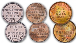
1930 Appreciation 200th Meeting, 1932 250th Meeting, 1936

Remember: This meeting is at Fort Mason and begins at 7:30pm.